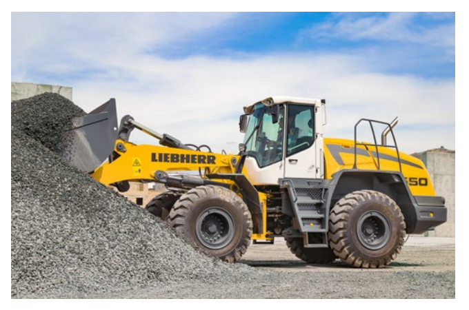
The Liebherr wheel loader L 550 stockpiling material efficiently at the batching plant.