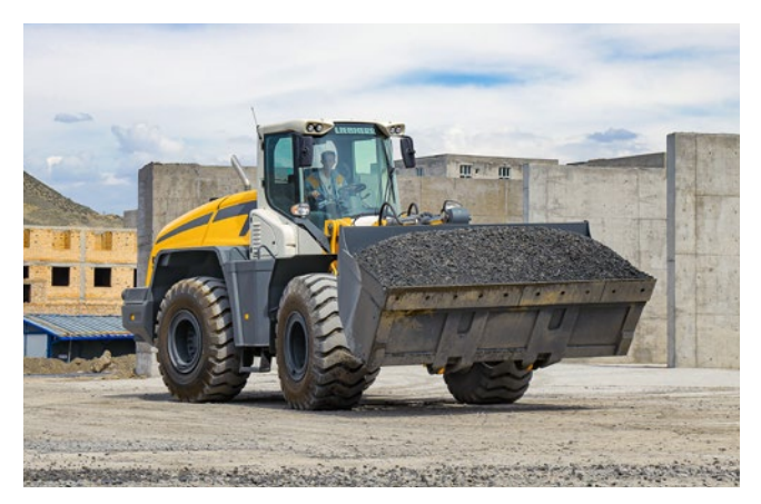
Xinjiang Hengshi Construction Materials Co. Ltd. appreciates the hydrostatic transmission technology of Liebherr wheel loaders.